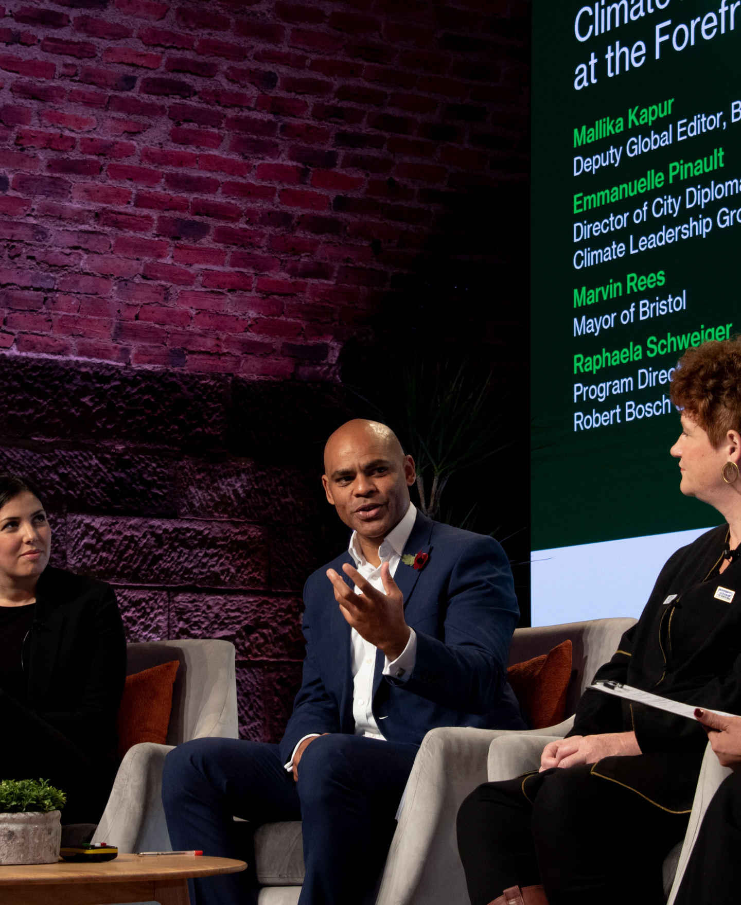
Mayor of Bristol, Marvin Rees, presenting the C40-MMC Global Mayors Action Agenda at the Bloomberg Green Summit, on November 9 th .